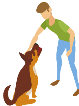
Aeñ booñ shyaeñ, kiya!