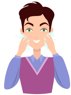
Kishiipeekina ta faes!