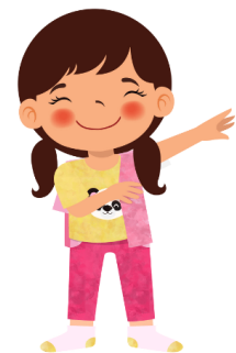
Potishka tooñ bitaeñ!