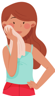
Kaashiiha ta faes!