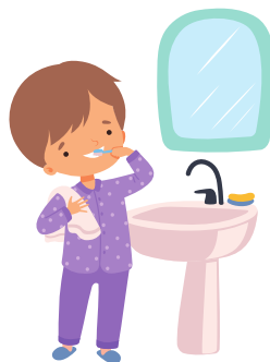
Kishiipeekina tii daañ!