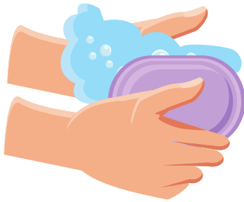
Gishiipeekinen mii maeñ.