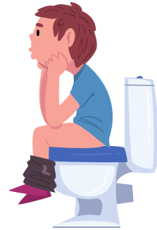
D-aapachistaan la klaazet.