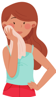
Gaashiihen ma faes.