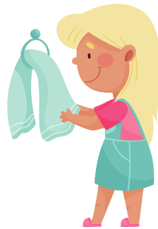
Gaashiihen mii maeñ.