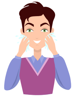
Gishiipeekinen ma faes.