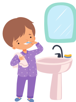
Gishiipeekinen mii daañ.