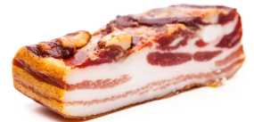
li laar bokanii